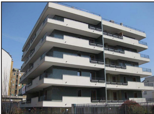
Milan, Via Valtellina 32/34 Customer: Giardini Benaco s.r.l. Demolition of buildings and construction of a residential building with 24 apartments and underground garages.