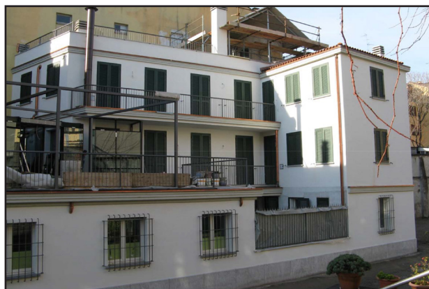
Milan, Corso Garibaldi 40 Customer: Private Property Renovation.