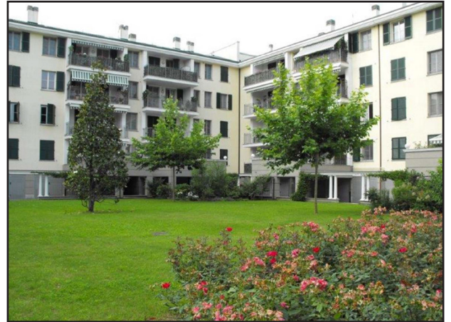
Trezzano sul Naviglio (MI), Via Giacosa Customer: Residenza Naviglio s.r.l.