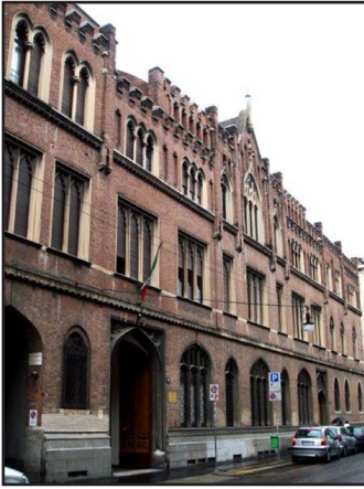
Milan, Via Conservatorio 2/4 - Customer: Istituto Vittoria Colonna Function adjustments of the scholastic building and the development of an indoor swimming pool in the courtyard of the Institute.